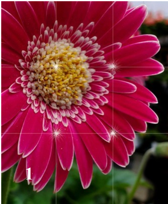
Linda O'Shaughnessy Photography Chairman

If you already took the photo and centered the subject, try cropping to position the subject at one of the intersections of the rule of thirds. You should have a free simple cropping tool on your phone, tablet or computer. In this example (2) both the before and after photos are shown. The bee is pretty much centered and the dark shadows of the petals on the left detract. By cropping, the photo is more interesting, and your eye focuses more on the bee, which is the main subject of this photo. Play with cropping and see what you think.